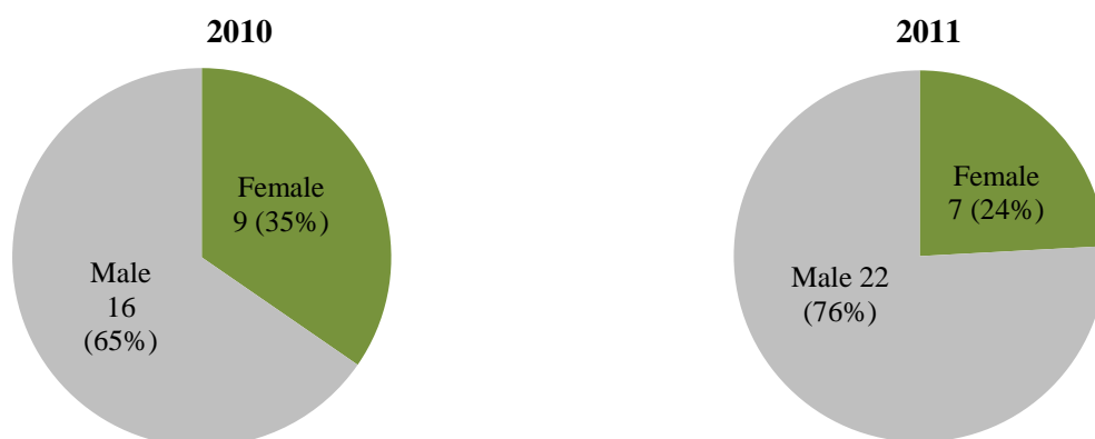
Figure 1: AGRODEP Membership Extensions

AGRODEP Management Team used the same selection criteria as in previous membership rounds. First, applicants must be based in Africa and have obtained a PhD within the last 15 years, or currently pursuing a PhD program, or have a Master's degree combined with technical skills and experience. The second set of criteria relates to research experience as evidenced from publications and any further training and workshops attended. Finally, as needed, regional, gender, and scientific diversity is ensured in the composition of members.